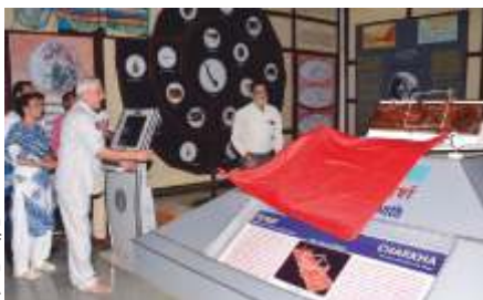
inauguration of Exhibit of the month CHARKHA