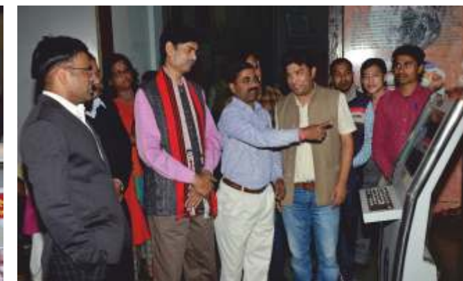
Inauguration of Exhibit of the Month Soi-Plong