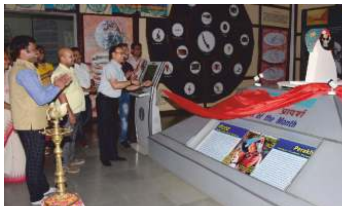
inauguration of Exhibit of the month Perakh