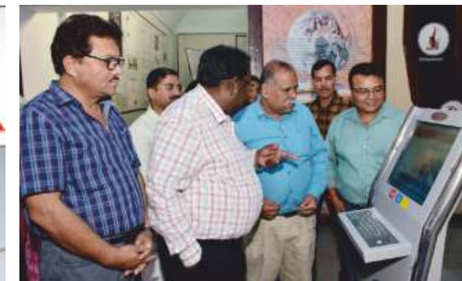
inauguration of Exhibit of the month Chamunda Kali