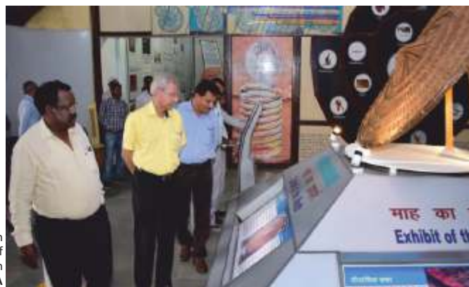
inauguration of Exhibit of the month FARRA