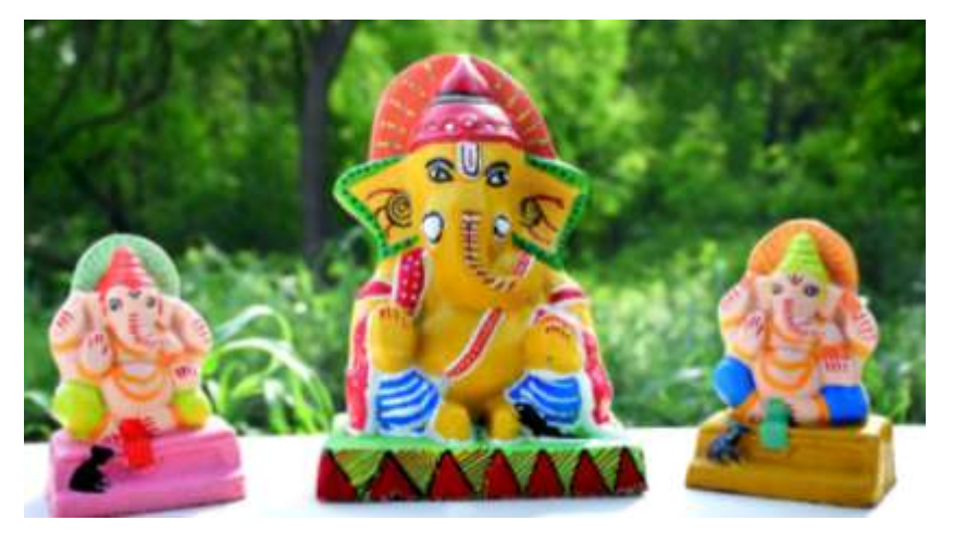
October to December 2021