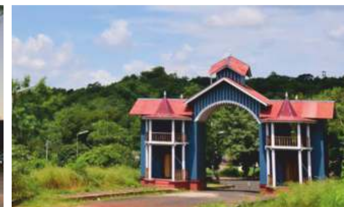
inauguration of KANGLA GATE of Manipur