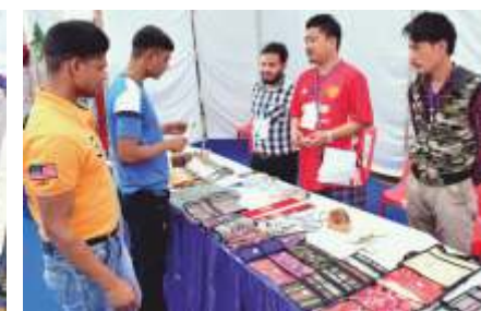
Traditional art and craft of SIKKIM on display