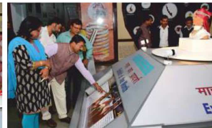
inauguration of Exhibit of the month JEVAR - Ornaments of Himachal Pradesh