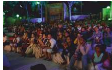
Performance of folk and fusion way of music and dance