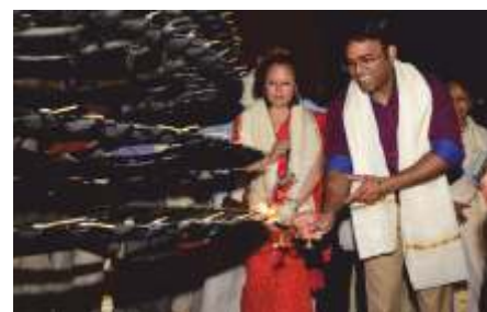
Celebration of Foundation day is marked by lighting of Al-Vilakku