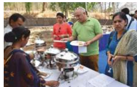
Glimpses of Ethnic cuisines of SIKKIM