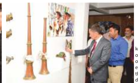
keen observation of the exhibition by the dignitaries