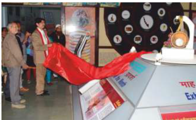
inauguration of Exhibit of the month EDDAKKA

hollow from inside and both ends are covered by thin skin extracted from the inner wall of cow's stomach. Idakka has two sides but only the front side is used to play it and the frontal part is identified by a bunch of colourful woollen balls tied to that side.