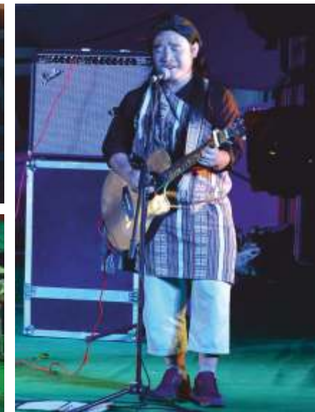
IGRMS campus was lightened up by marvellous performance by Folk Fusion Band of Sikkim – SOFIYUM