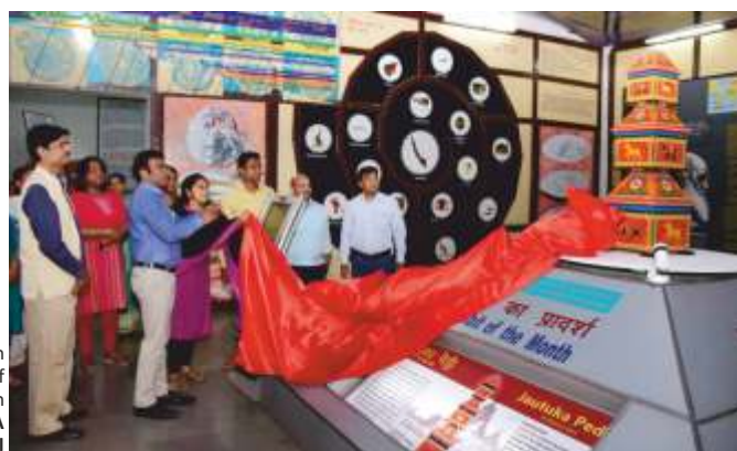
inauguration of Exhibit of the month JAUTUKA PEDI