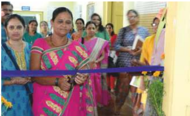
inauguration of Exhibit of the month CHAKRI JHUL