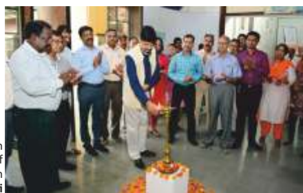
inauguration of Exhibit of the month Dhumavati