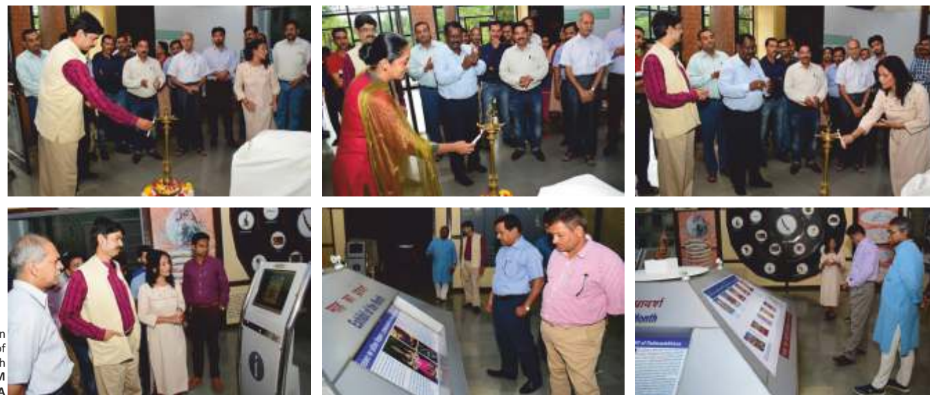
inauguration of Exhibit of the month GURU PADM SAMBHAVA