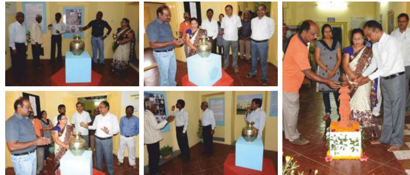
inauguration an Exhibit of the Month KOLSI