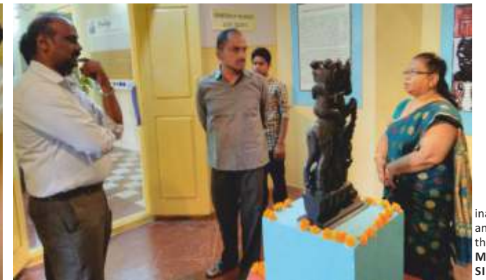
inauguration of Exhibit of the Month MARA SIRPAM