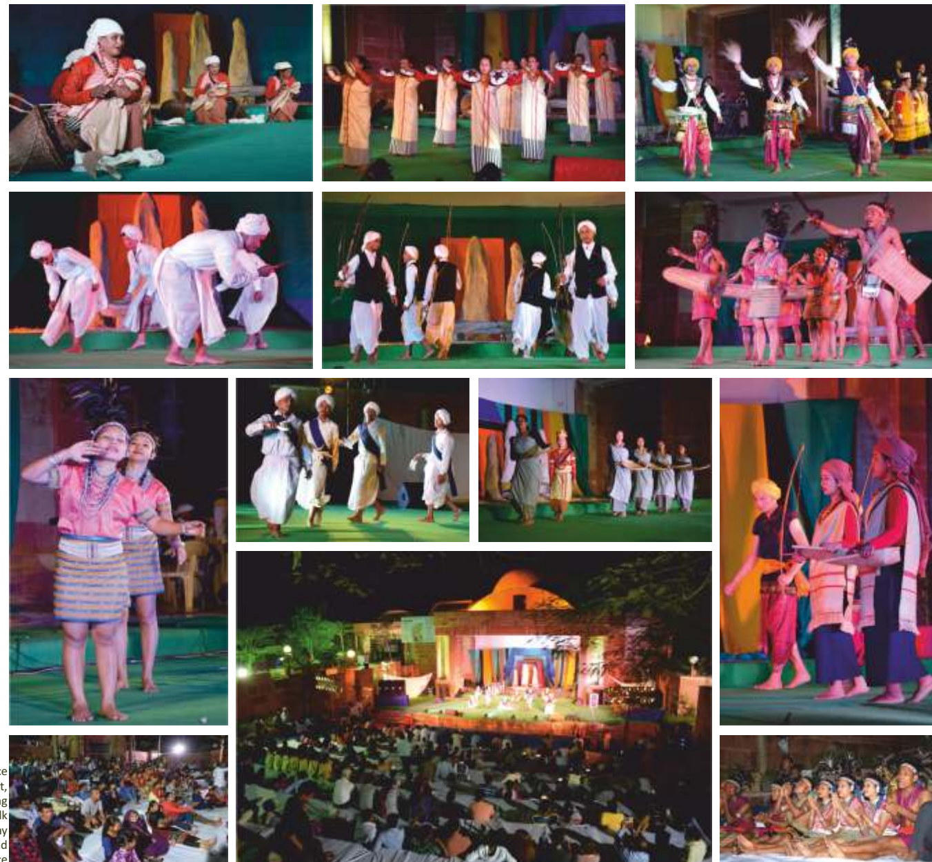
Performance of Summersalt, mesmerising mixture of folk and fusion way of music and dance

The three day cultural evening was commenced with maryied performances of folk dances and musical nites giving a respite to the audience a beautiful musical culture and tradition of the state of Meghalaya.