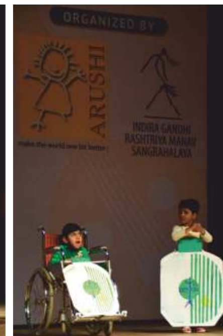
Talents of the Divyang kids staged under Ek Taal Ek Saal