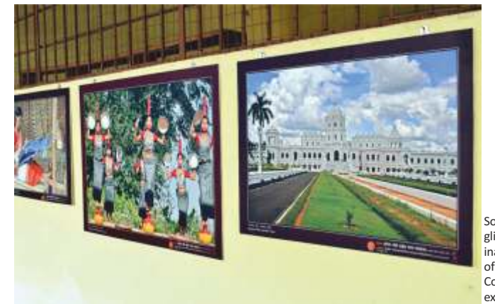
Some glimpses of inauguration of Heritage Corner exhibition