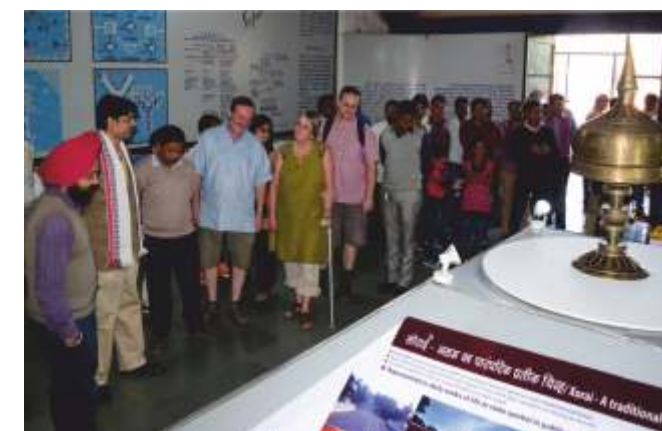
Inauguration of Sorai, a traditional symbol of Assam state