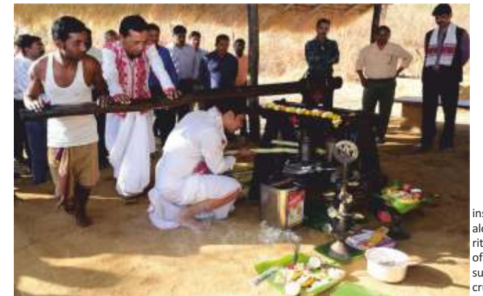
installation along with ritual opening of traditional sugar cane crusher