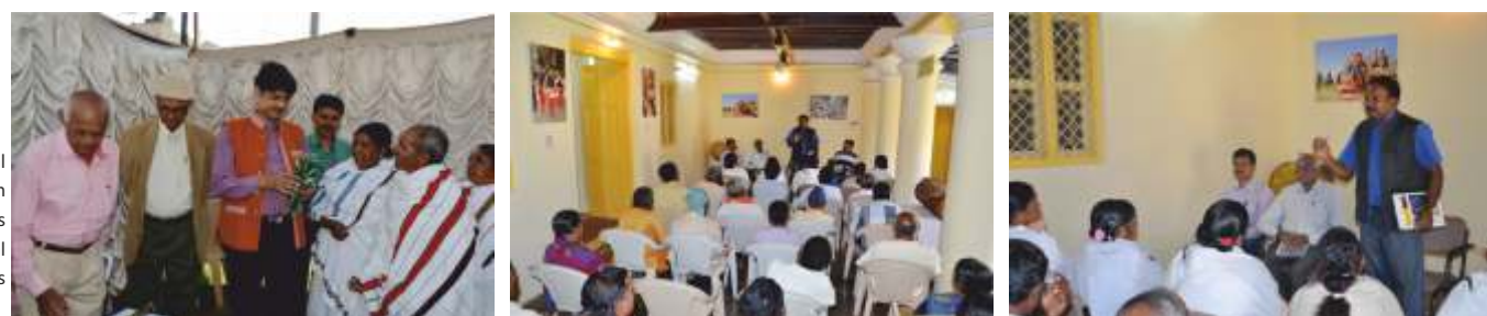
National Workshop on Tribal Healers & Tribal Medicines