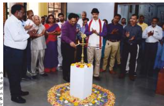
inauguration of Batchi, a traditional drape of Brokpa women from Jammu & Kashmir