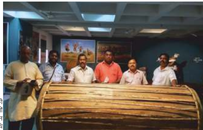
संग्रहालय की विभिन्न दीर्घाओं का अवलोकन करते मा. अतिथि