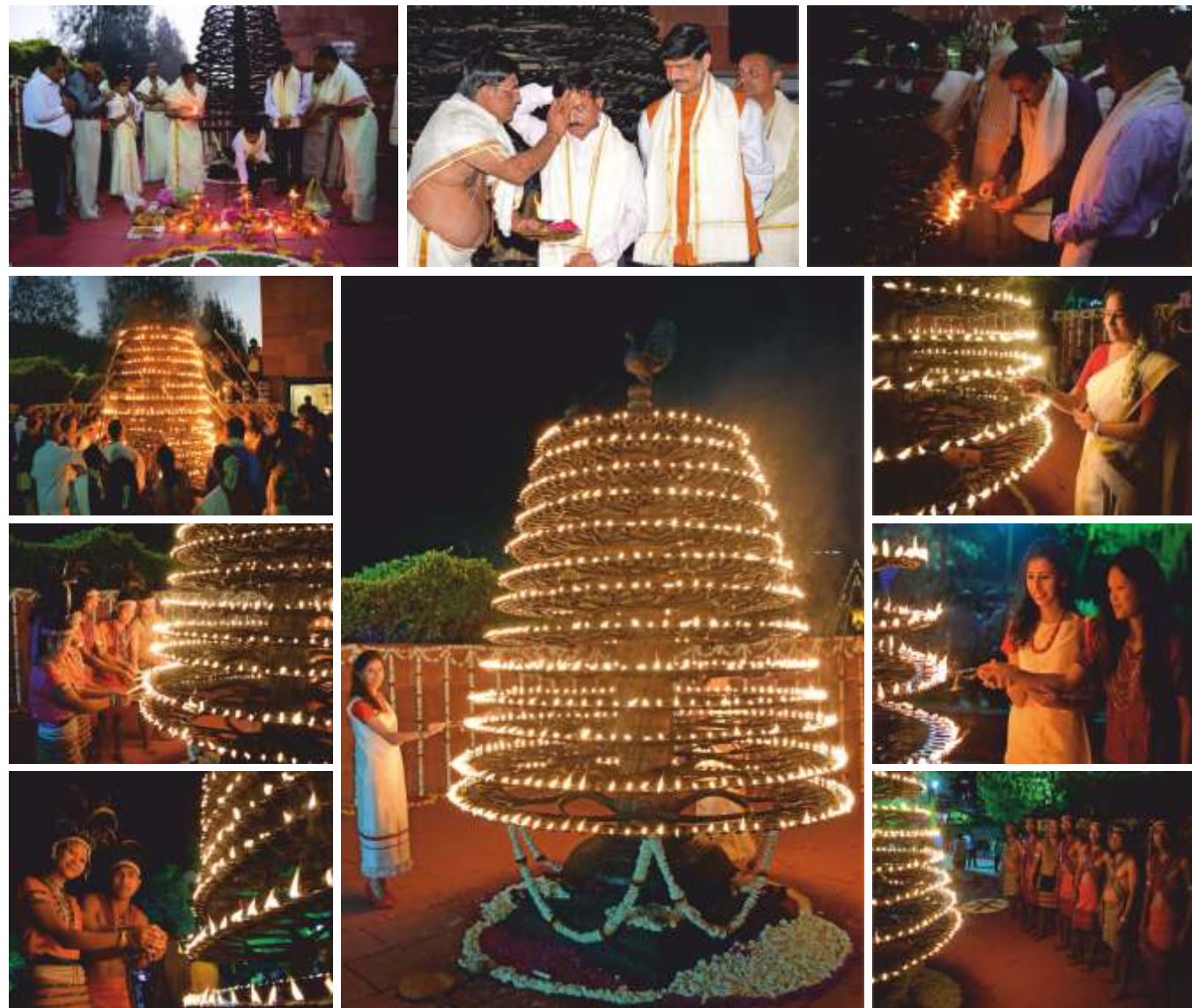
Celebration of Foundation day is marked by lighting of Al-Villaku

The grand opening of the regional festival of Meghalaya commenced with the formal lighting 1001-wicked traditional lamp “Al-Villaku” by a group of people from the Malayali community of the Bhopal City. Lighting of this unique lamp from Kerala has been a unique attraction that continue to mark the formal opening of the foundation day of the museum the last one decade