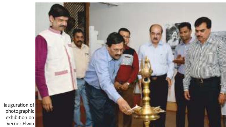
Inauguration of photographic exhibition on Verrier Elwin

The exhibition displays a small part of the archive of photographs taken by Verrier Elwin that document a critical period of transition and the objective is to draw attention to the urgent need to conserve and digitize the archive to be able to preserve Elwin's unique legacy for the future. The exhibition comes from the archival collections of Sri. Ashok Elwin and it was opened to the public on 21 st March 2017.