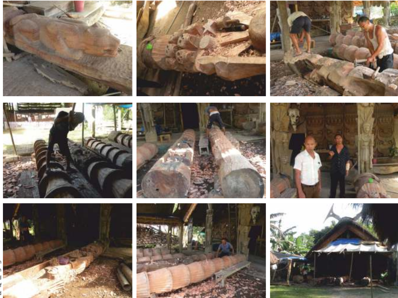
Museum Workshop on Wood Carving of Nagaland