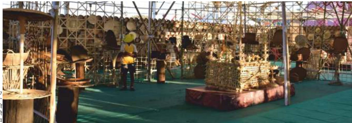
लोकरंग 2017 अंतर्गत "मंडप" प्रदर्शनी में प्रदर्शित बांस की कलाकृतियाँ