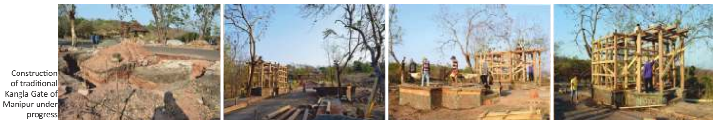
Construction of traditional Kangla Gate of Manipur under progress