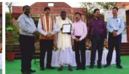
Artists felicitated by the chief guests and other dignitaries