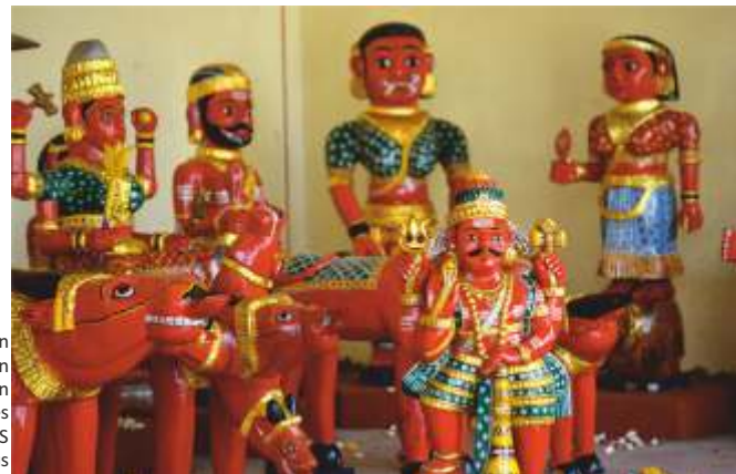
Inauguration of exhibition based on Bhuta Figures in IGRMS campus