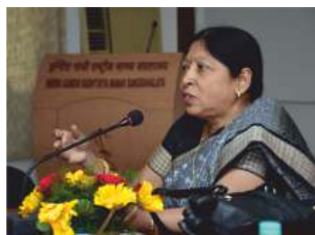
Dignitaries and participants sharing their views and opinions during the seminar