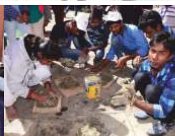
Some glimpses of different activities organised during Kalrav Bal Mela