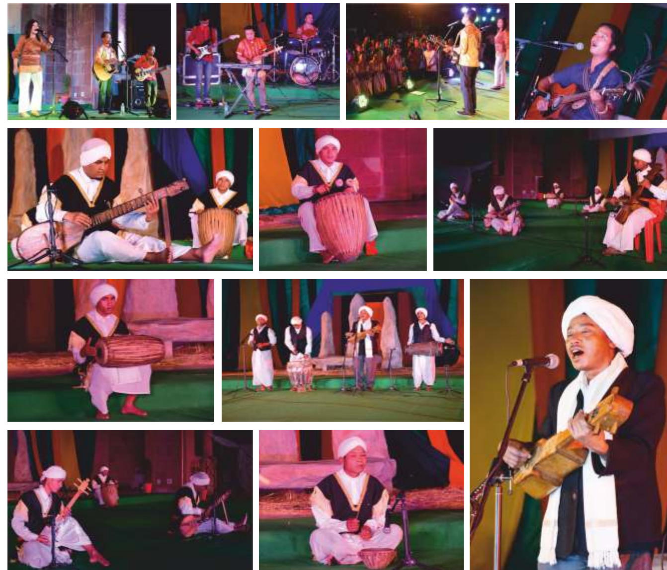
IGRMS campus was lightened up by marvellous performance by Pintre Orchestra of Meghalaya

Programmes devoted to the state of Meghalaya was organised in the cultural evening. The famous band of Meghalaya- Pintre orchestra gave enthralling performances on the occasion. The band is a group of artists known for their unique blend of compositions using ancient musical instruments of the Khasi tribe like the Saitar, Duitar, Mryngod (a string instrument), Ksing Kynthei, Ksing Shynsang, Shaw Shaw and Padiah etc. mesmerised the audience.