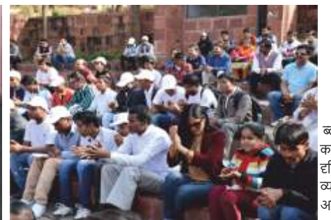
ब्लाइंड चौलेन्ज कार रैली में दृष्टिहीन व्यक्तियों का अनोखा प्रदर्शन