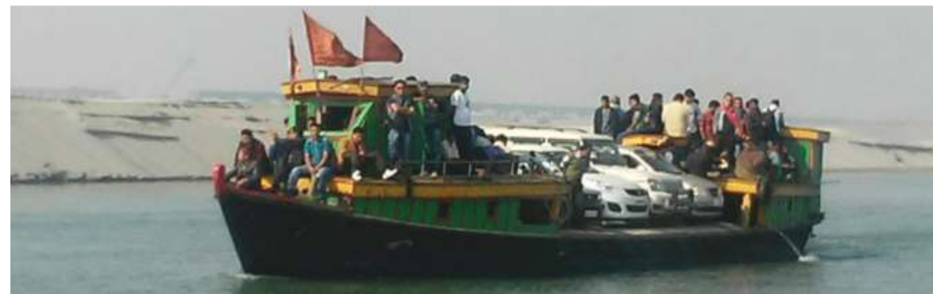
A view of Inland Water Transport in Pasighat, Arunachal Pradesh