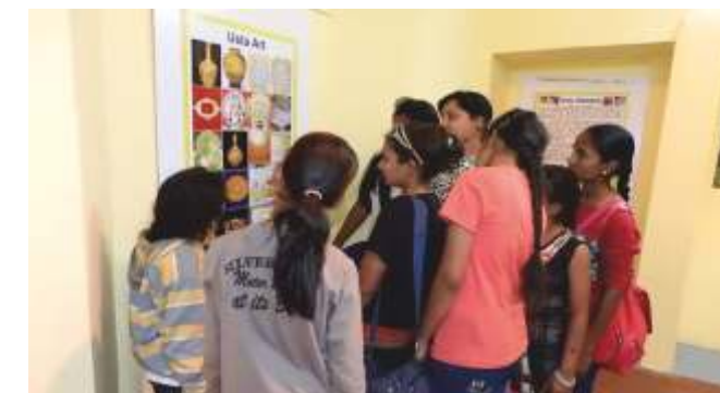
Inauguration of Exhibit of the Month at SRC, Mysore