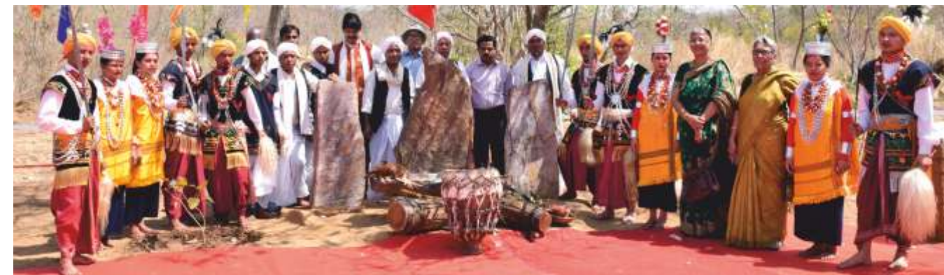
Enactment of associated rituals of Maw-Bu-Khar, a sacred grove of Meghalaya