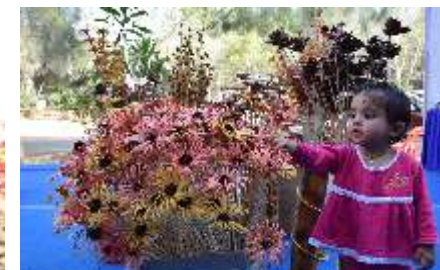
Traditional art and craft of Meghalaya on display