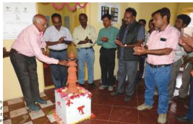
Inauguration of Exhibit of the Month at SRC, Mysore