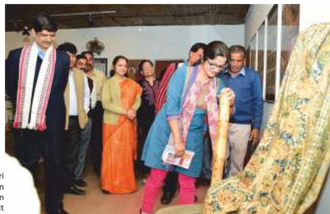
Kalamkari exhibition inauguration along with visit