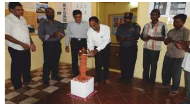
Inauguration of Exhibit of the Month at SRC, Mysore