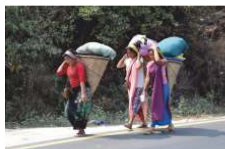
Documentation of the life ways and people of Meghalaya: Field Photographs