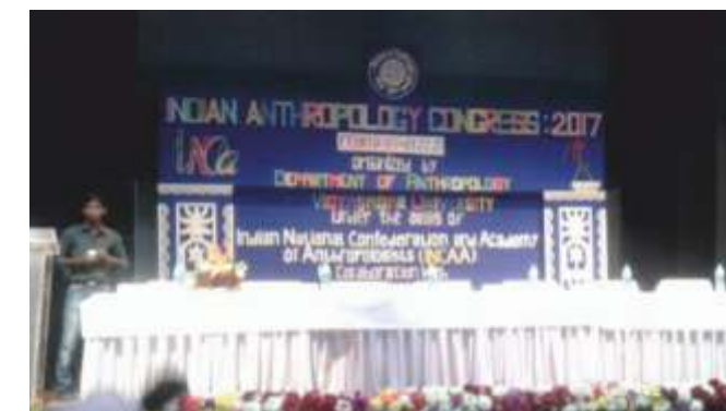
Dignitaries during the inaugural event of the Indian Anthropological Congress 2017