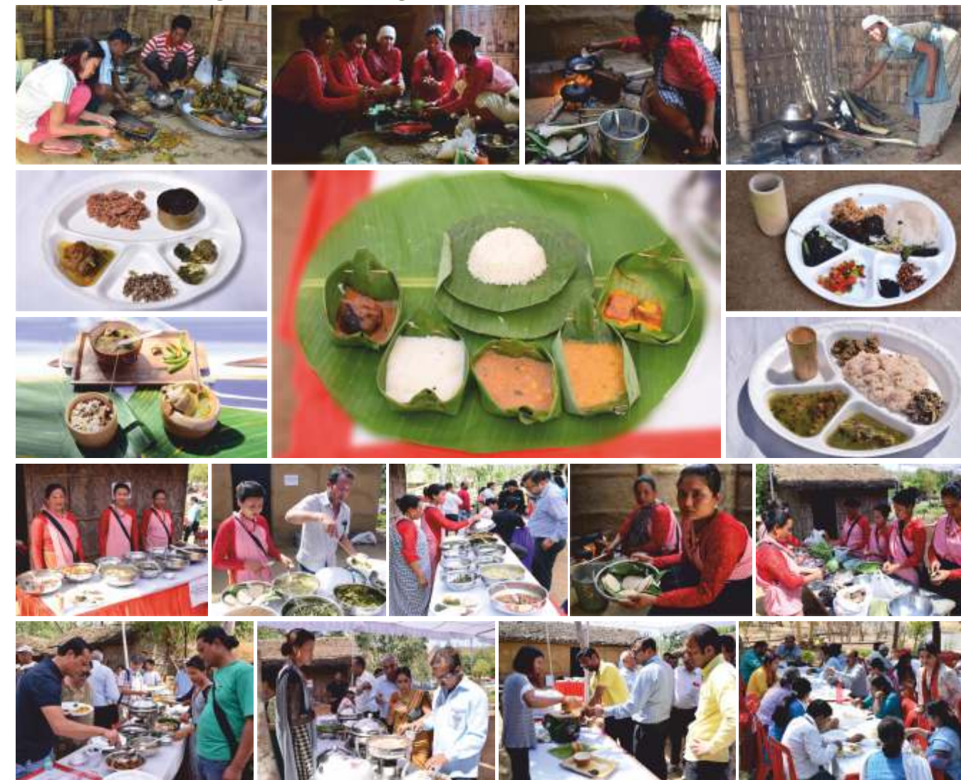
Glimpses of Ethnic cuisines of Meghalaya

This foundation day, under the celebration of regional festival from the state of Meghalaya, IGRMS organised food festival from Meghalaya for the visitors. The people of Meghalaya have their indigenous culinary practices. Museum attempted to bring these ever relishing food items of Meghalaya for the food lovers and its visitors. Many of the indiginous recepies ranging from boiled, smoked, steamed, dried, grilled and smashed and unsmashed vegetables and green leafy items to a wide variety of tasety rice, chapatis and millet foods both in vegetarian and non-vegeterian meals fervoured the taste of the visitors.