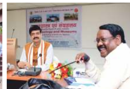
A glimpse from the workshop on Anthropology and Museums for University Teachers