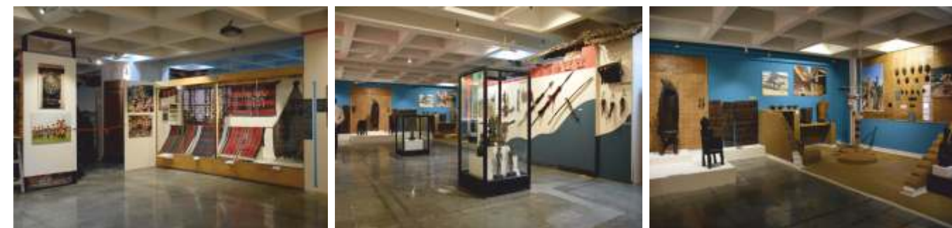
Some glimpses of the inauguration and the exhibition