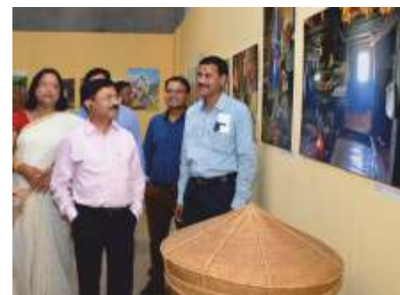
keen observation of the exhibition by the dignitaries