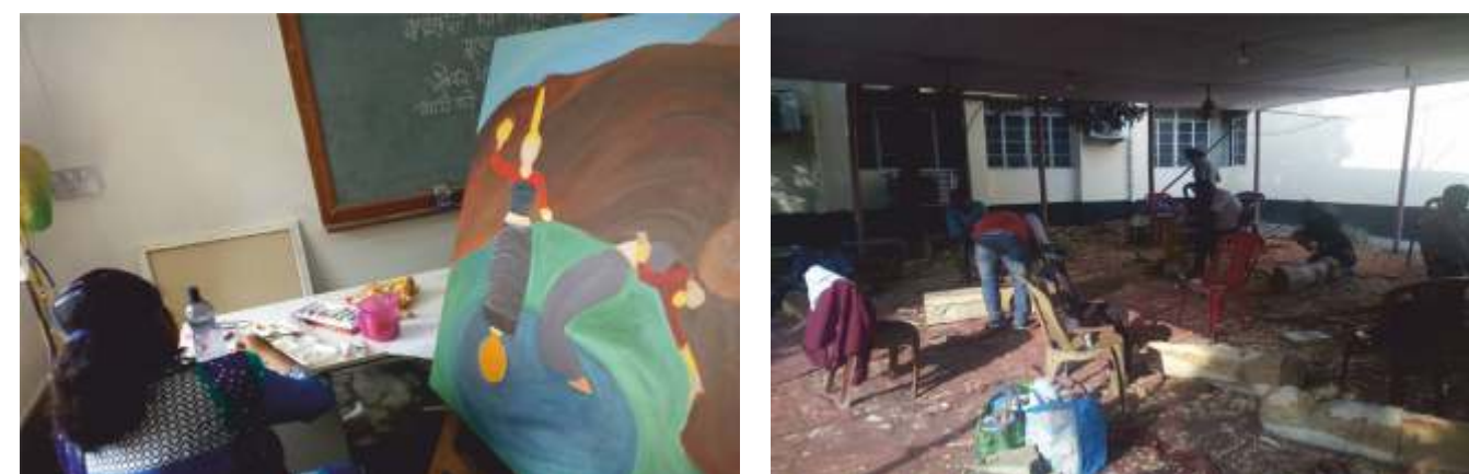
A view of Artist Workshop at Department of Fine Arts, Tripura University