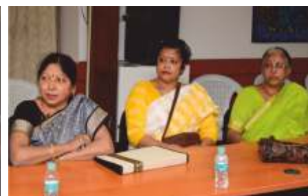
Keen dignitary audience of the annual IGRMS lecture