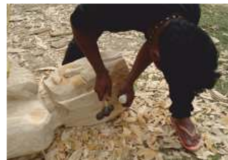
Traditional wood carvers carving sculpture of Hindu Gods during the workshop