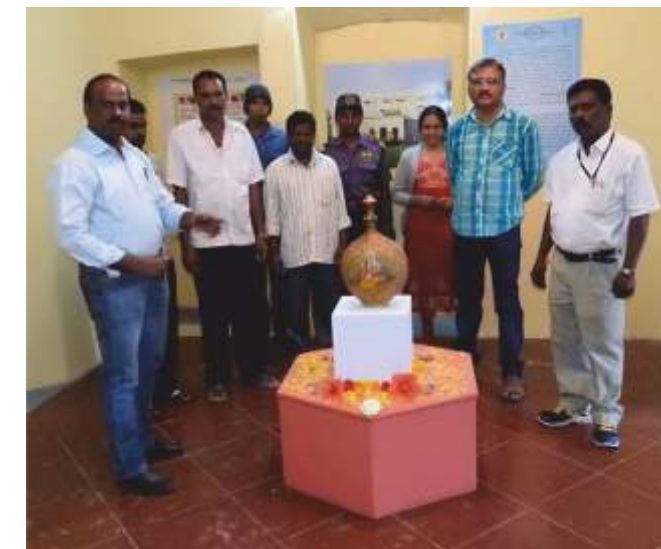
EXHIBIT OF THE MONTH

An object from the Usta community of Rajasthan was on display for the exhibit of the month January 2017 at the IGRMS Southern Regional Centre, Mysuru. The object is used for keeping oil for the domestic purpose. Made out of camel hide, chalk powder, multhani clay, stone colors and gold foil the object in itself is an example of the excellent craftsmanship which continue to exist the Usta community from many a generation. In the contemporary times, the object of this kind is largely replaced by the metal and plastic containers.