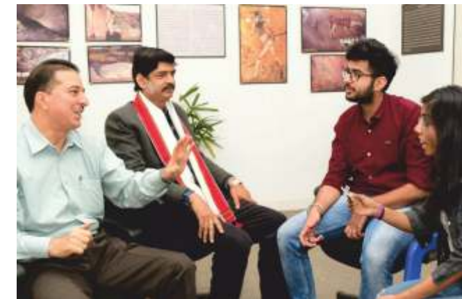
students interacting with the experts