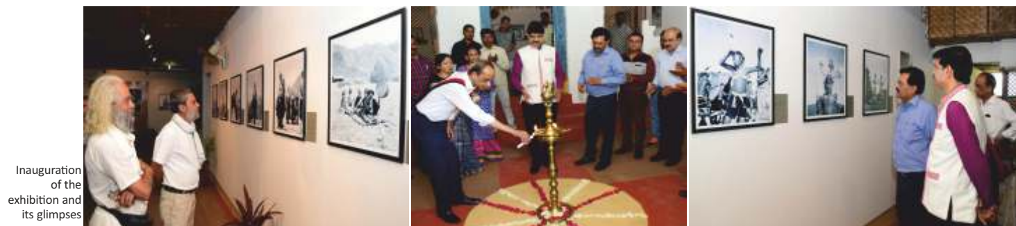
Inauguration of the exhibition and its glimpses