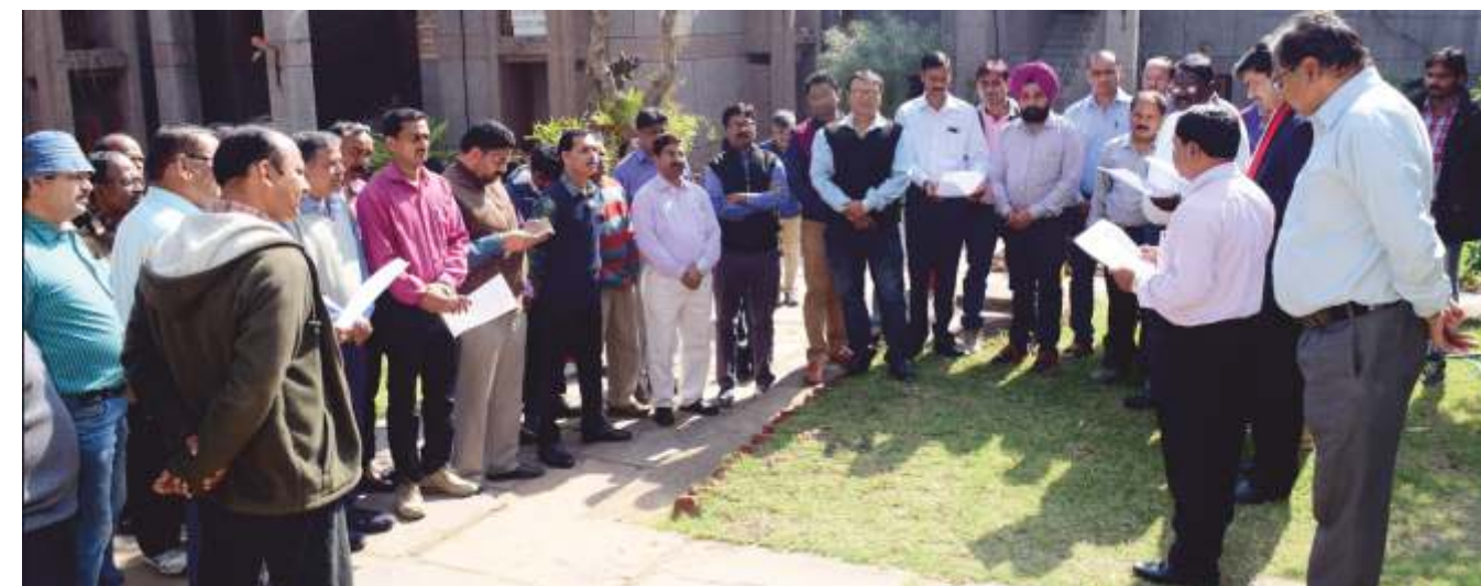
मतदाता शपथ ग्रहण करते हुए संग्रहालय के निदेशक सह स्टाफ