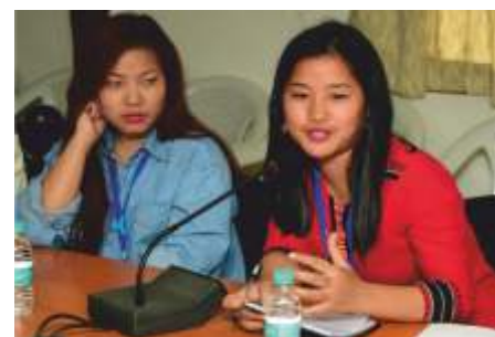
A glimpse from the workshop on Anthropology and Museums for University Students