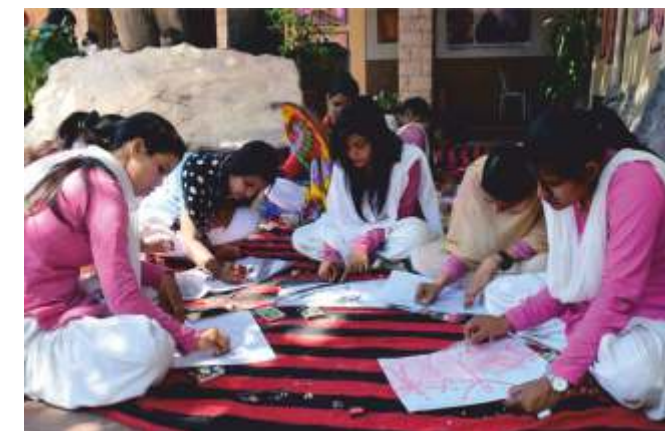
Poster making activity during the workshop on Rock Art