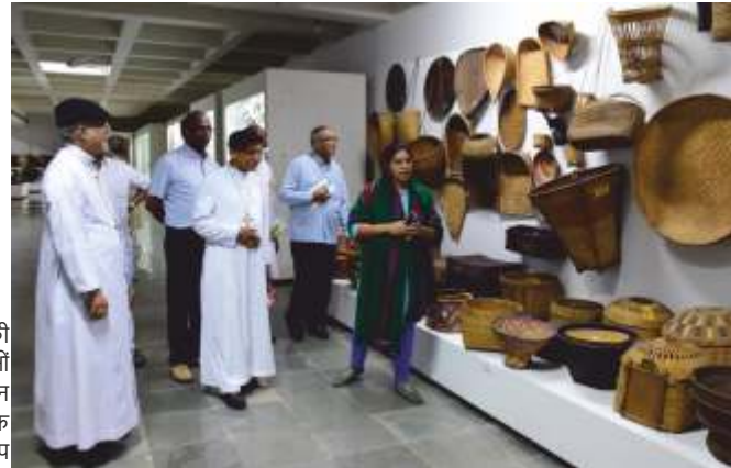
संग्रहालय की विभिन्न दीर्घाओं का अवलोकन करते कैथोलिक बिशप

इंदिरा गाँधी राष्ट्रीय मानव संग्रहालय में भारत के विभिन्न प्रांतों से अखिल भारतीय कैथोलिक बिशप कांफ्रेंस, भोपाल में प्रतिभागिता करने आये लगभग 80 बिशपों ने संग्रहालय भ्रमण किया। इस अवसर पर उन्होंने पारम्परिक तकनीकी पार्क एवं वीथी संकुल अन्तरंग प्रदर्शनी भवन का अवलोकन किया। सभी ने संग्रहालय के प्रदर्शों एवं प्रदर्शनियों की प्रशंसा करते हुए कहा कि "यह हमारे पूर्वजों की थाती है इसको आने वाली पीढ़ियों के लिए संजोकर रखने का अतुलनीय प्रयास है"।