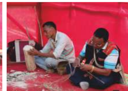
Artists Workshop at the Department of Cultural Studies, Tezpur University